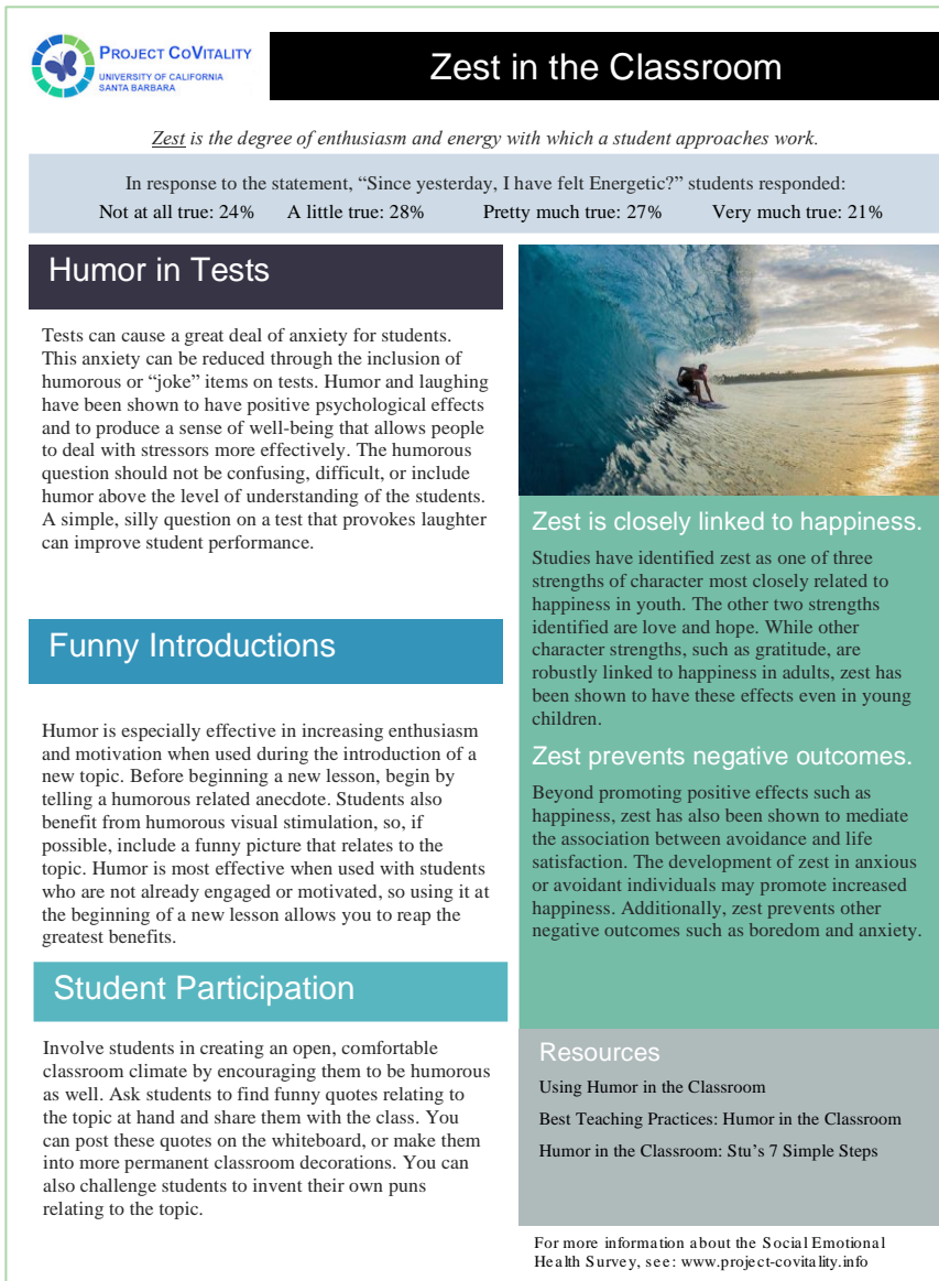
Figure 1. Example of Zest Information Handout. Also, see http://project-covitality.info/prevention-and-intervention/covitality-resource-list.pdf for additional information and strategies for the 12 Covitality Mindsets.

Twelve handouts were created summarizing classroom-based interventions and resources targeting the 12 strength areas measured by the SEHS-S; one was reviewed at each meeting (see an example handout in Figure 1). Finally,